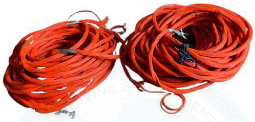
Diving Umbilical with protective outer sheet