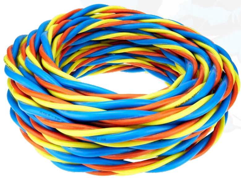
Diving Umbilical without protective outer sheet